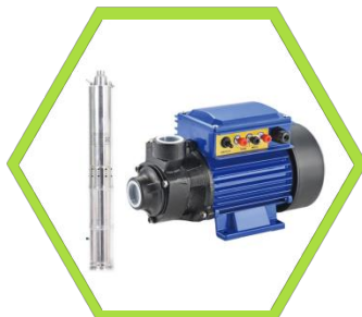
Pump and Motor set