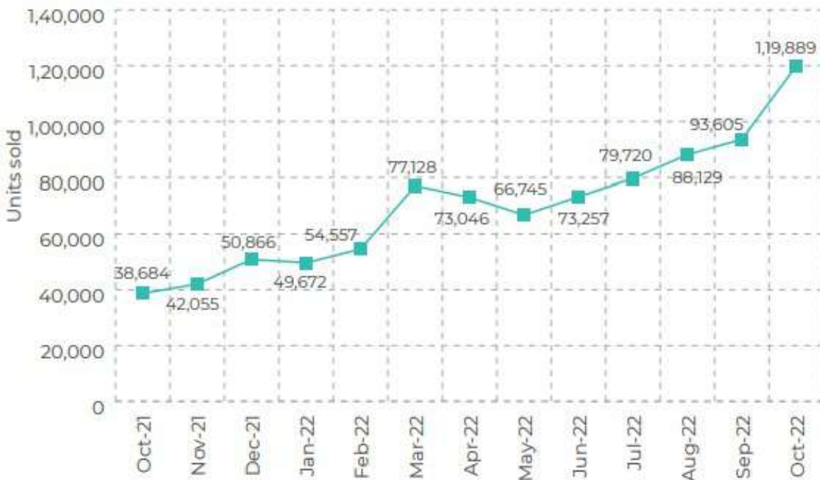
Registered EV Sales Trend in India (October 2021–October 2022)

Source: Vahan Dashboard, Company Press Releases, JMK Research Note: Sales figures represent EVs registered across 1,340 RTOs in 34 states/ UTs.