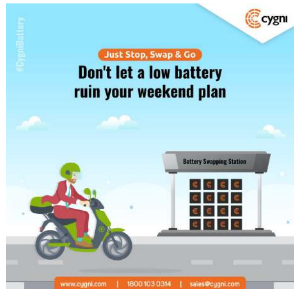
Swapping Technology Batteries for EV