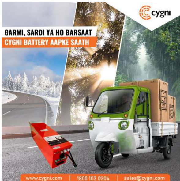
Li-Ion Battery for Loader Vehicles

Note: Sales figures represent EVs registered across 1,349 RTOs in 34 states/ UTs; Others include adapted vehicle, agricultural tractor, goods carrier, and recovery vehicle.